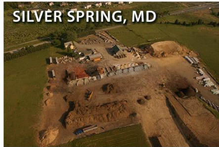
SILVER SPRING, MD